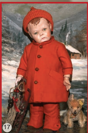
17) 14" Kruse Type in Factory Clothes - unusual compo body w jtd. hands, innocent face, mint felt Tunic & Leggings. $650; Unusual Black Platform Horse - 8" t, no hair loss, great mane, tail & other details! Handsome. $295; Cabinet Size Cart - 6" t. orig. clean paint, stenciled "Coal". $325