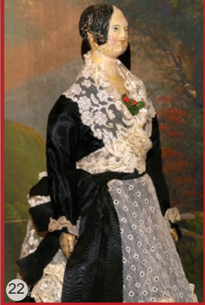
22) A 21" Attic Original 1860's Wooden - A very rare Queen Victoria on her Original Leather Fashion Body in layers of dramatic silk taffeta & lace. Historic rare Victoria with expected paint flakes. Not $3000 just $1250