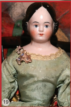
19) Early 21" Pink Tint Kestner - 1840's creamy color, blue eyes, great homemade body jtd. to sit. Early 3/4 porc. Arms! $450